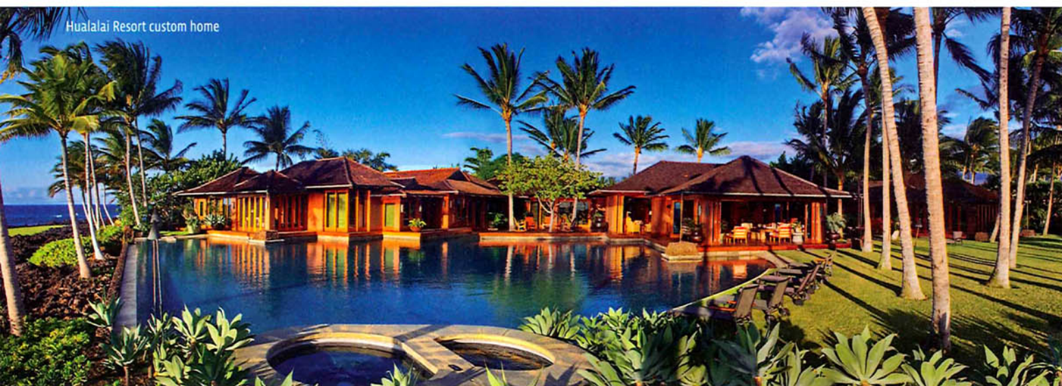
Hualalai Resort custom home