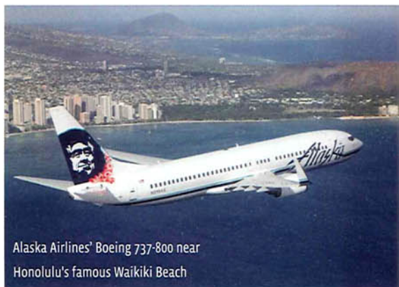
Alaska Airlines' Boeing 737-800 near Honolulu's famous Waikiki Beach

How To Get There: While nonstop service to the Big Island from San Diego is not yet available, Alaska Airlines is expanding its service between San Diego and Hawaii by launching daily nonstop flights between the